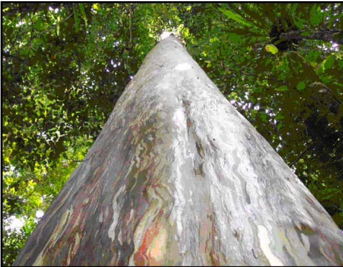
“The Review complimented the quality of harvesting management in the Open Bay project”

Papua New Guinea’s large-scale timber harvesting operations do not comply with the requirement to provide a sustained yield of timber and can therefore be no measure of environmental sustainability. While the problems that have given rise to this situation have been clearly identified there is no evidence of measures being taken to change the current paradigm.