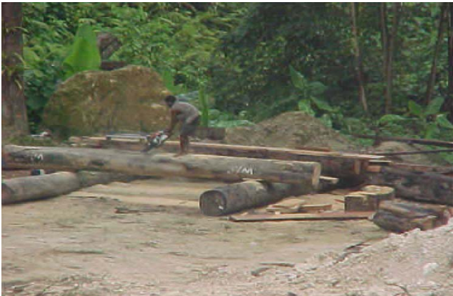
“Absolutely no regard for safety and safe working practices” 50

In each of the four projects, laws relating to the employment of overseas workers were being abused, there was no formal training or skills development and no regard for employees' health and safety.